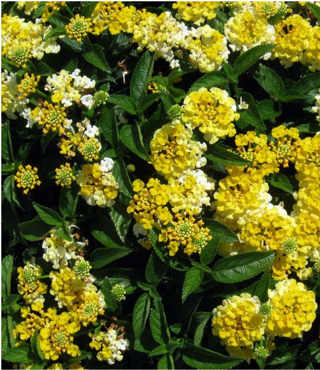
'Bandana Lemon Zest' -- Really nice color combination and low growing. Yum!