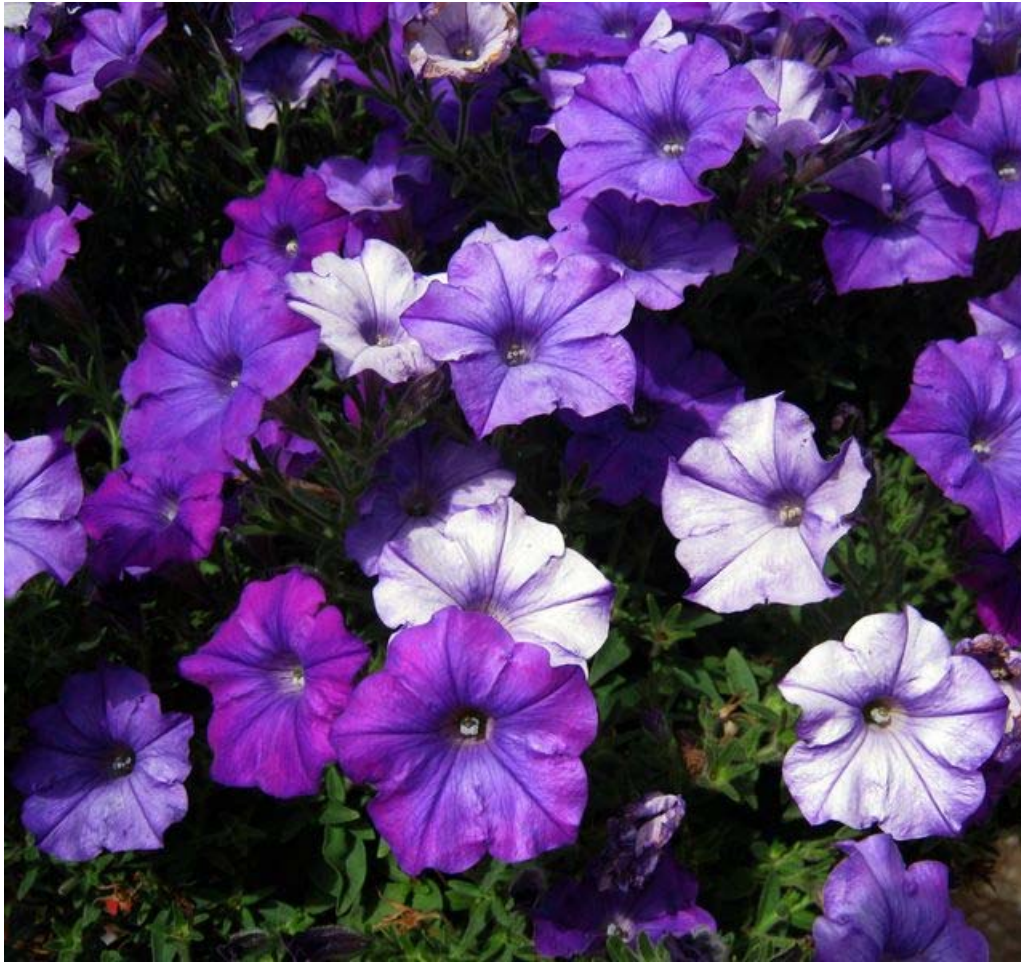
Petunia 'Shockwave Denim.' As you can see, Grumpy's a sucker for cool blue petunias that take the heat. This one trails too, produces hundreds of flowers on a plant that can spread 3-4 feet, and the blue blooms gradually fade, just like jeans. Look for this one at garden centers now.