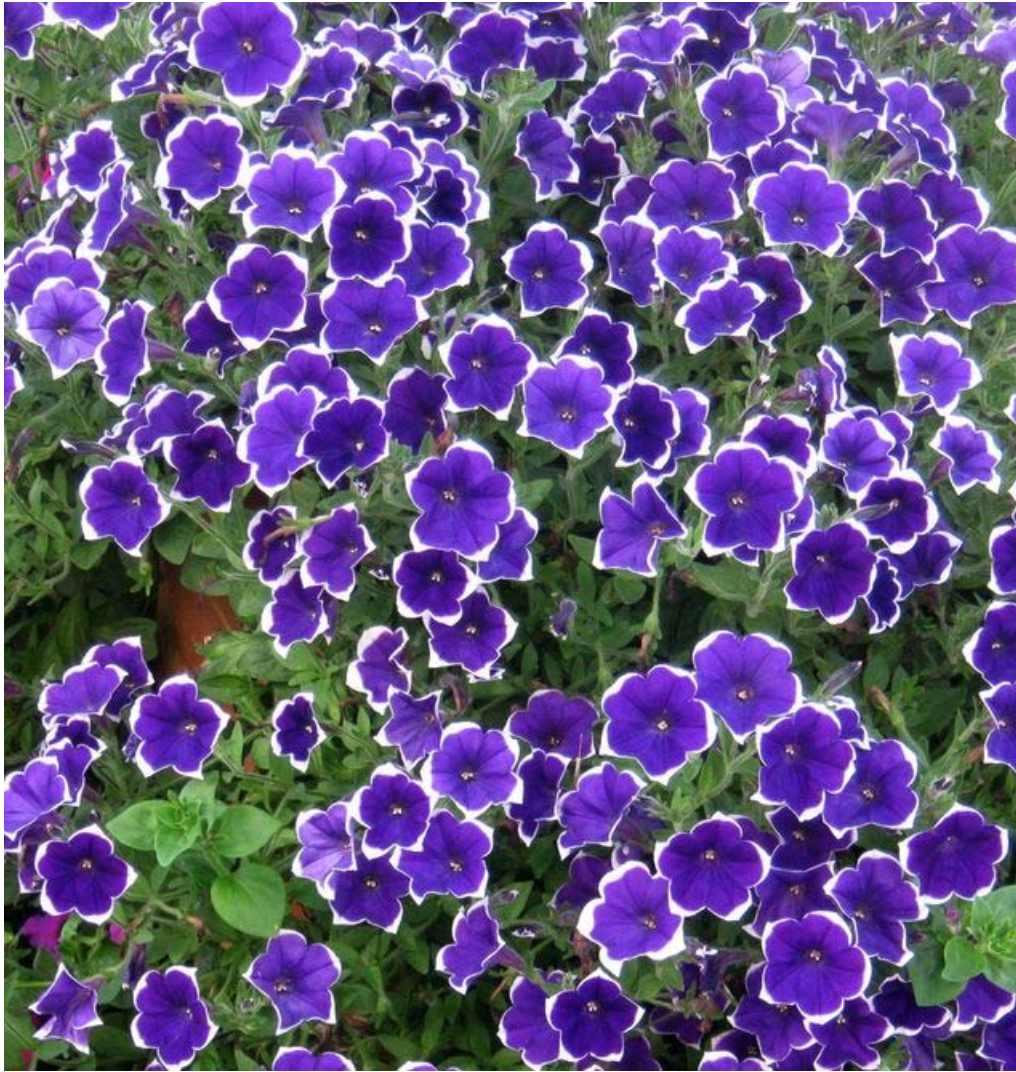
Petunia 'Rhythm and Blues' is a knockout with a deep blue blossom picoteed with a white edge. It has a trailing habit and looks great in beds, containers, and hanging baskets. You can get this one now. Here's another showstopper: