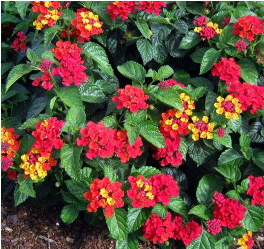
'Bandana Red'-- Looks a lot like 'Bandito Red. Maybe all banditos wear bandanas.