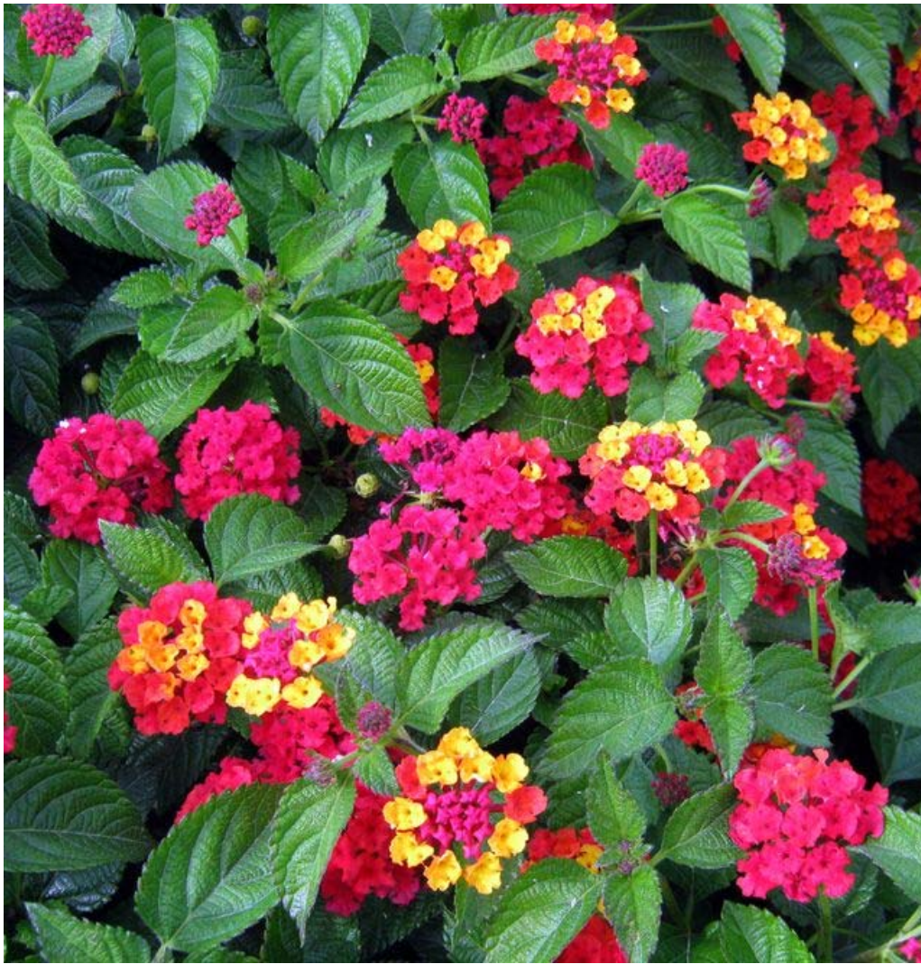
'Bandito Red' -- Crazy color! Can't miss this in the garden unless you're Stevie Wonder.